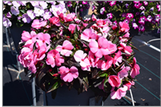
Sonic Light Pink New Guinea Impatiens in bloom

Sonic Light Pink New Guinea Impatiens will grow to be about 12 inches tall at maturity, with a spread of 12 inches. When grown in masses or used as a bedding plant, individual plants should be spaced approximately 10 inches apart. Its foliage tends to remain dense right to the ground, not requiring facer plants in front. This fast-growing annual will normally live for one full growing season, needing replacement the following year.