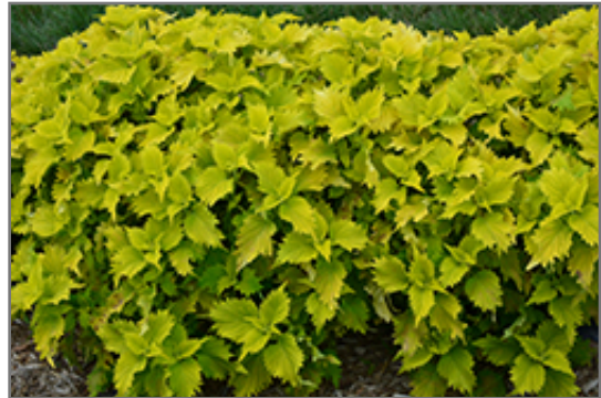
Wasabi Coleus