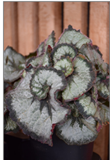
Escargot Begonia foliage