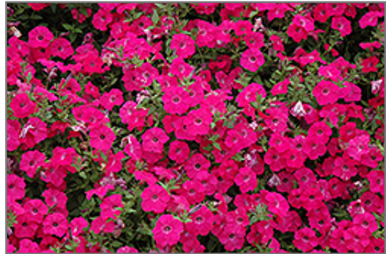
Tidal Wave Hot Pink Petunia in bloom