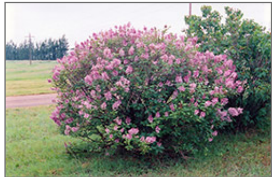
Miss Canada Lilac in bloom