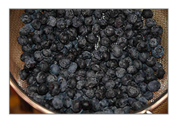
Brigitta Blueberry fruit

Brigitta Blueberry features dainty clusters of white bell-shaped flowers with shell pink overtones hanging below the branches in mid spring. It has green deciduous foliage which emerges coppery-bronze in spring. The glossy oval leaves turn an outstanding burgundy in the fall. It features an abundance of magnificent blue berries from mid to late summer. The smooth yellow bark adds an interesting dimension to the landscape.