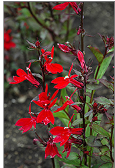
Fan Scarlet Cardinal Flower flowers