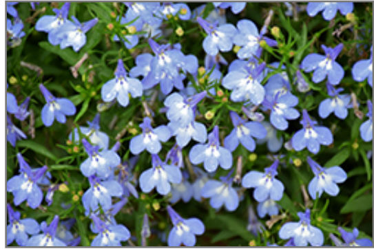
Techno Upright Light Blue Lobelia flowers

Techno Upright Light Blue Lobelia is recommended for the following landscape applications;