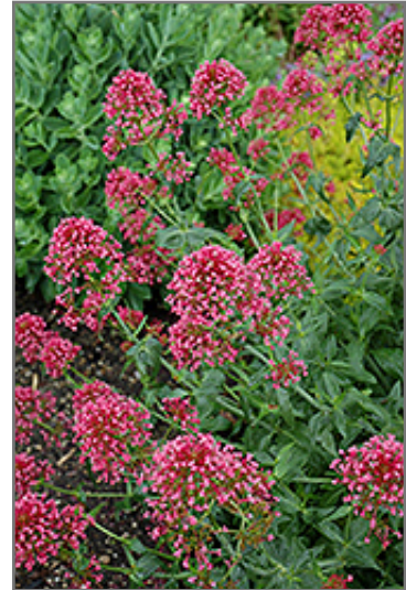
Red Valerian flowers

Red Valerian is recommended for the following landscape applications;