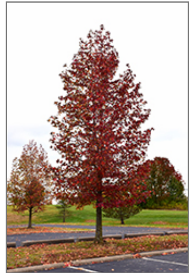
Happidaze Sweet Gum in fall