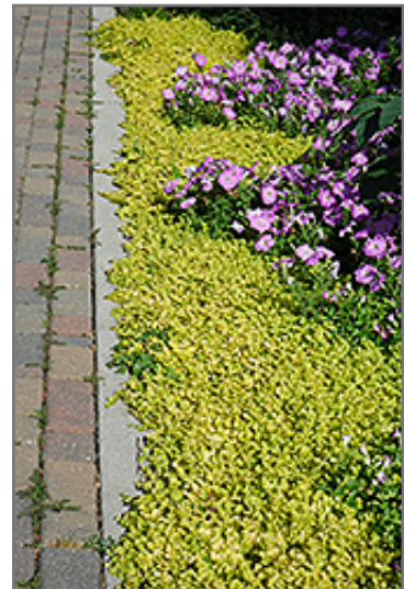
Golden Creeping Jenny