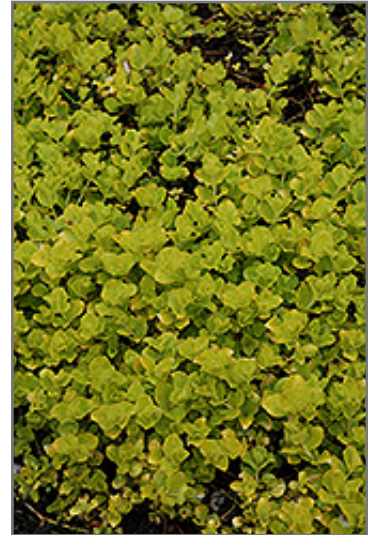
Golden Creeping Jenny foliage

Golden Creeping Jenny is recommended for the following landscape applications;