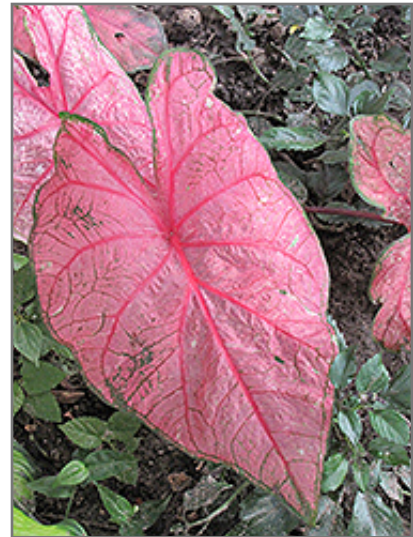
Fannie Munson Caladium foliage

Fannie Munson Caladium is recommended for the following landscape applications;