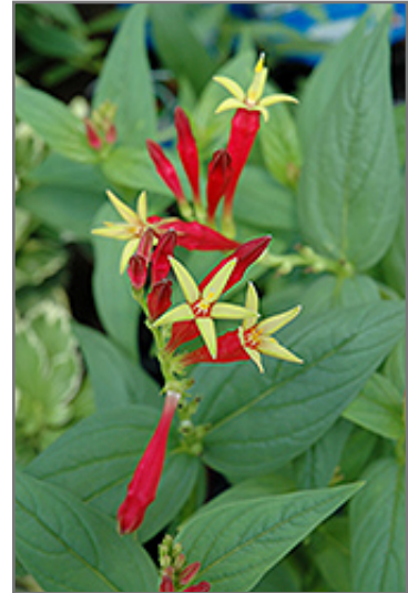
Indian Pink flowers

Indian Pink is recommended for the following landscape applications;