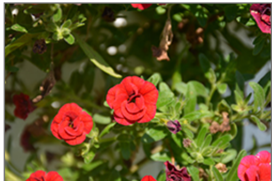
MiniFamous Double Compact Red Calibrachoa flowers