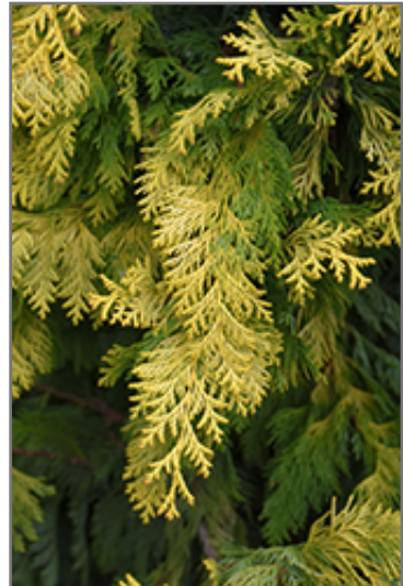
Cripps Gold Falsecypress foliage