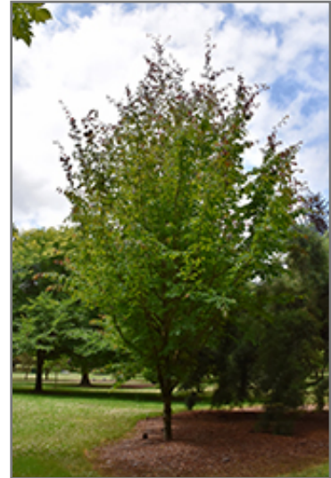
Ruby Vase Parrotia