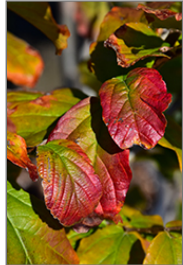
Ruby Vase Parrotia in fall

This tree should only be grown in full sunlight. It is very adaptable to both dry and moist locations, and should do just fine under average home landscape conditions. It is not particular as to soil type or pH. It is highly tolerant of urban pollution and will even thrive in inner city environments. This is a selected variety of a species not originally from North America.