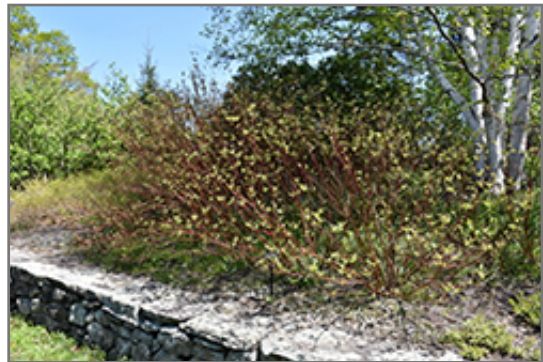
Bailey's Red Twig Dogwood in spring