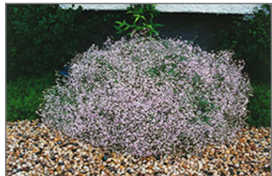
Pink Fairy Baby's Breath in bloom