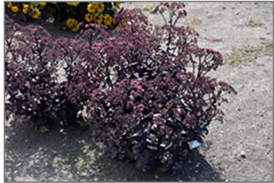
Cherry Truffle Stonecrop in bloom