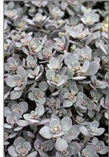
SunSparkler Blue Elf Sedoro foliage

SunSparkler Blue Elf Sedoro is a fine choice for the garden, but it is also a good selection for planting in outdoor pots and containers. Because of its spreading habit of growth, it is ideally suited for use as a 'spiller' in the 'spiller-thriller-filler' container combination; plant it near the edges where it can spill gracefully over the pot. Note that when growing plants in outdoor containers and baskets, they may require more frequent waterings than they would in the yard or garden.