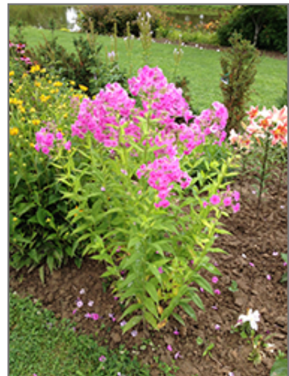
Peacock Rose Dark Eye Garden Phlox in bloom