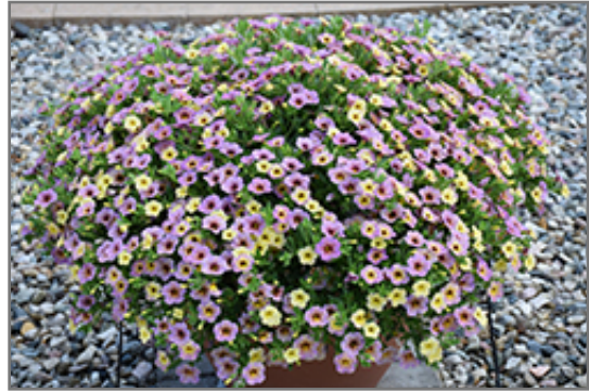
Chameleon Blueberry Scone Calibrachoa in bloom