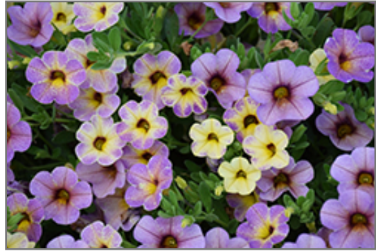
Chameleon Blueberry Scone Calibrachoa flowers

Chameleon Blueberry Scone Calibrachoa is a dense herbaceous annual with a trailing habit of growth, eventually spilling over the edges of hanging baskets and containers. Its medium texture blends into the garden, but can always be balanced by a couple of finer or coarser plants for an effective composition.