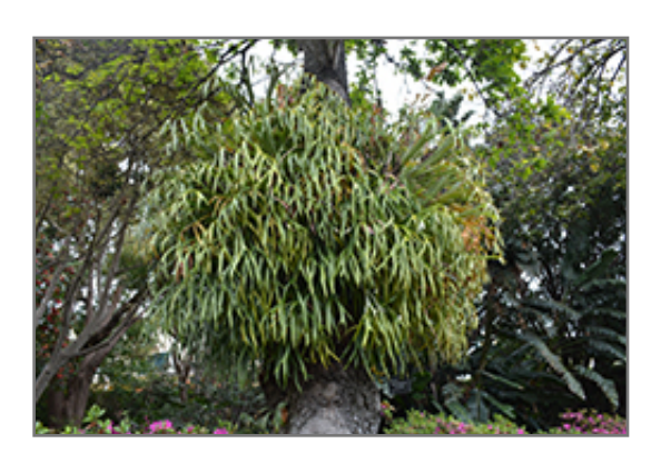
Staghorn Fern