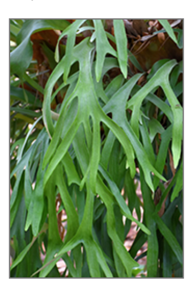
Staghorn Fern foliage