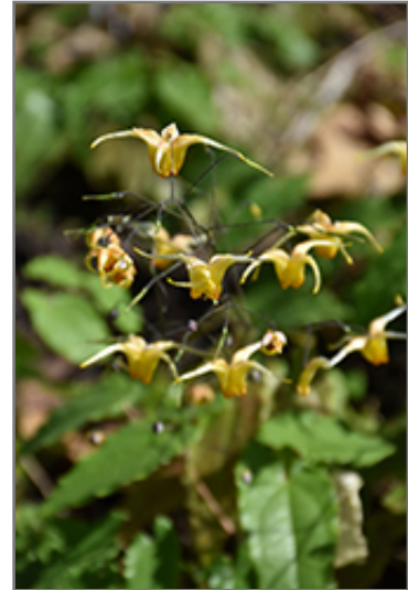
Amber Queen Barrenwort flowers

Amber Queen Barrenwort is recommended for the following landscape applications;