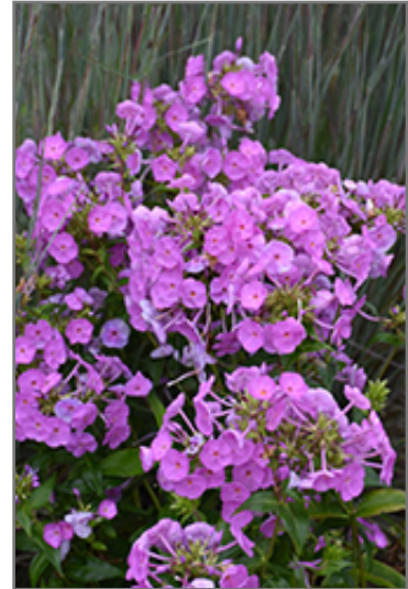
Fashionably Early Flamingo Garden Phlox flowers