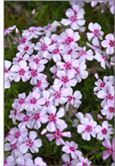
Coral Eye Moss Phlox flowers

Coral Eye Moss Phlox will grow to be only 4 inches tall at maturity, with a spread of 18 inches. When grown in masses or used as a bedding plant, individual plants should be spaced approximately 14 inches apart. Its foliage tends to remain low and dense right to the ground. It grows at a medium rate, and under ideal conditions can be expected to live for approximately 10 years. As an evergreen perennial, this plant will typically keep its form and foliage year-round.