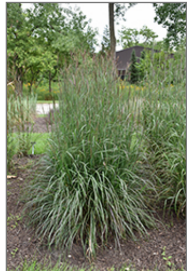
Blackhawks Bluestem in bloom