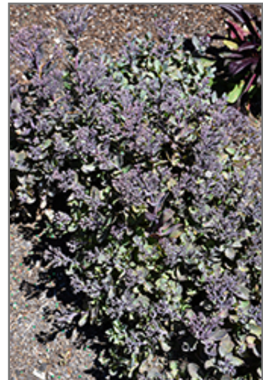
Dynomite Stonecrop in bloom