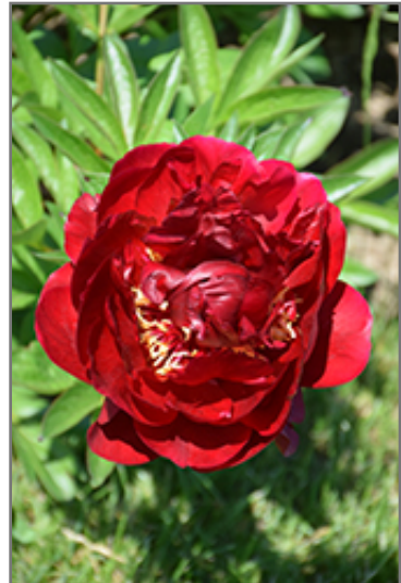
Buckeye Belle Peony flowers