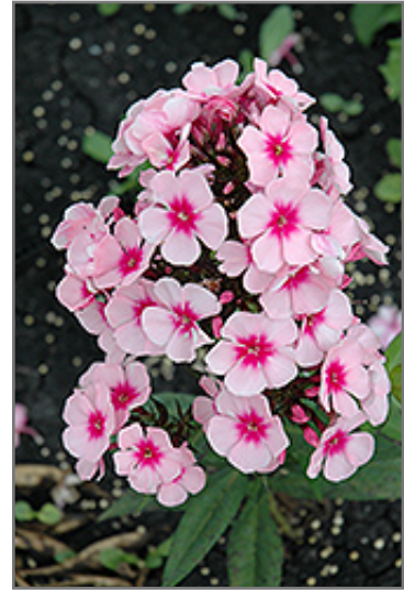
Bright Eyes Garden Phlox flowers

Bright Eyes Garden Phlox is a fine choice for the garden, but it is also a good selection for planting in outdoor pots and containers. With its upright habit of growth, it is best suited for use as a 'thriller' in the 'spiller-thriller-filler' container combination; plant it near the center of the pot, surrounded by smaller plants and those that spill over the edges. It is even sizeable enough that it can be grown alone in a suitable container. Note that when growing plants in outdoor containers and baskets, they may require more frequent waterings than they would in the yard or garden.