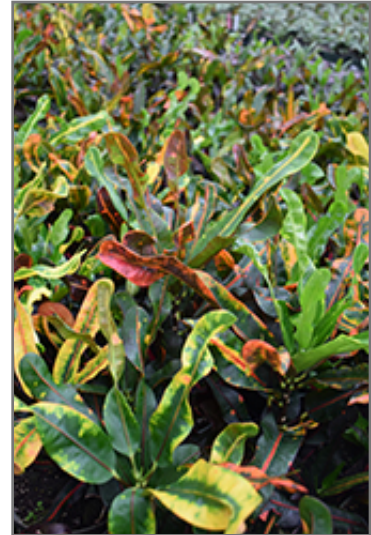
Mammy Croton in full

This is a dense herbaceous evergreen houseplant with an upright spreading habit of growth. Its wonderfully bold, coarse texture is quite ornamental and should be used to full effect. This plant should not require much pruning, except when necessary to keep it looking its best.