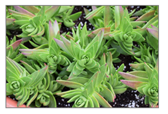
Shark's Tooth Crassula foliage

Shark's Tooth Crassula features delicate clusters of white star-shaped flowers at the ends of the stems in mid summer. Its attractive succulent pointy leaves remain chartreuse in color with prominent crimson tips throughout the year.