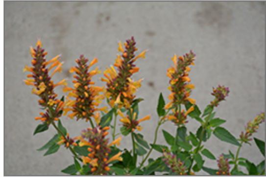
Kudos Gold Hyssop flowers