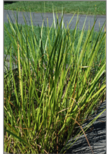
American Sweet Flag foliage