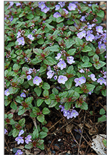
Waterperry Blue Speedwell in bloom