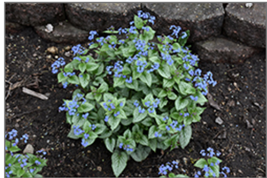
Sterling Silver Bugloss in bloom