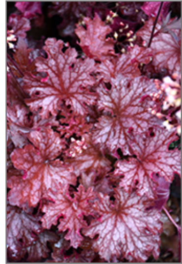
Ruby Tuesday Coral Bells foliage

Ruby Tuesday Coral Bells will grow to be about 9 inches tall at maturity extending to 16 inches tall with the flowers, with a spread of 14 inches. When grown in masses or used as a bedding plant, individual plants should be spaced approximately 12 inches apart. Its foliage tends to remain low and dense right to the ground. It grows at a medium rate, and under ideal conditions can be expected to live for approximately 10 years. As an evergreen perennial, this plant will typically keep its form and foliage year-round.