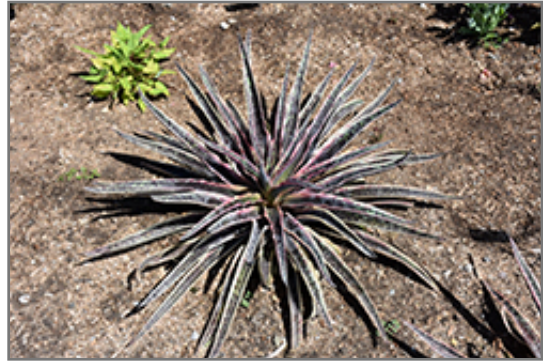
Art Deco Mangave