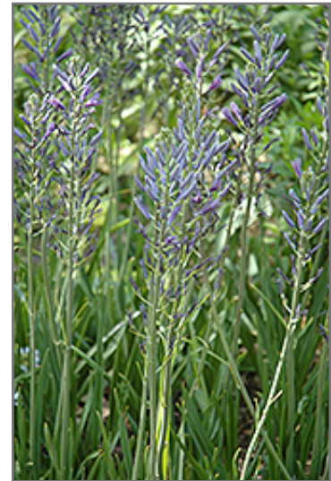
Blue Camassia flowers