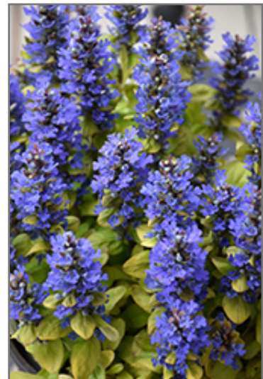
Feathered Friends Petite Parakeet Bugleweed flowers