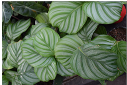
Color Full Orbifolia Prayer Plant foliage