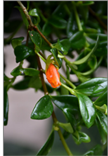
Goldfish Plant flowers

This is a dense herbaceous evergreen houseplant with a trailing habit of growth, eventually spilling over the edges of hanging baskets and containers. This plant can be pruned at any time to keep it looking its best.