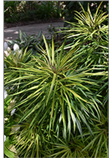
Variegated Miagos Bush

This tropical plant performs well in both full sun and full shade. It prefers to grow in average to moist conditions, and shouldn't be allowed to dry out. This plant does not require much in the way of fertilizing once established. It is not particular as to soil pH, but grows best in sandy soils. It is somewhat tolerant of urban pollution. This is a selected variety of a species not originally from North America.; however, as a cultivated variety, be aware that it may be subject to certain restrictions or prohibitions on propagation.