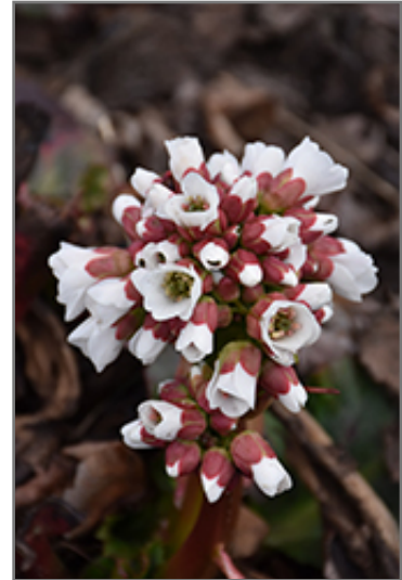
Happily Ever After Bergenia flowers