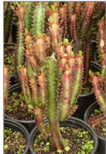
Rubra African Milk Tree in full