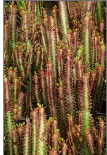
Rubra African Milk Tree stems

When grown indoors, Rubra African Milk Tree can be expected to grow to be about 9 feet tall at maturity, with a spread of 4 feet. It grows at a medium rate, and under ideal conditions can be expected to live for approximately 60 years. This houseplant will do well in a location that gets either direct or indirect sunlight, although it will usually require a more brightly-lit environment than what artificial indoor lighting alone can provide. It does best in average soil that is neither too wet nor too dry, and may die if left in standing water for any length of time. This plant should be watered when the surface of the soil gets dry, and will need watering approximately once each week. Be aware that your particular watering schedule may vary depending on its location in the room, the pot size, plant size and other conditions; if in doubt, ask one of our experts in the store for advice. Like most succulents and cacti, it prefers to grow in poor soils and should therefore never be fertilized. It is not particular as to soil pH, but grows best in sandy soil. Contact the store for specific recommendations on pre-mixed potting soil for this plant. Be warned that parts of this plant are known to be toxic to humans and animals, so special care should be exercised if growing it around children and pets.