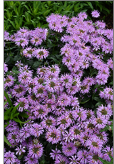
Leading Lady Lilac Beebalm flowers