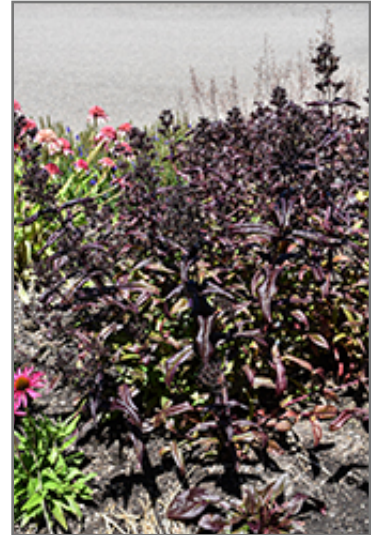
Dakota Burgundy Beard Tongue

Dakota Burgundy Beard Tongue is a fine choice for the garden, but it is also a good selection for planting in outdoor pots and containers. With its upright habit of growth, it is best suited for use as a 'thriller' in the 'spiller-thriller-filler' container combination; plant it near the center of the pot, surrounded by smaller plants and those that spill over the edges. Note that when growing plants in outdoor containers and baskets, they may require more frequent waterings than they would in the yard or garden.