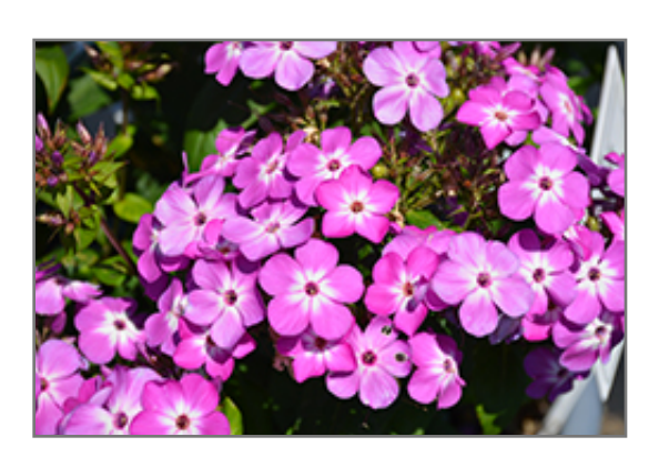
Flame Pro Purple Garden Phlox flowers