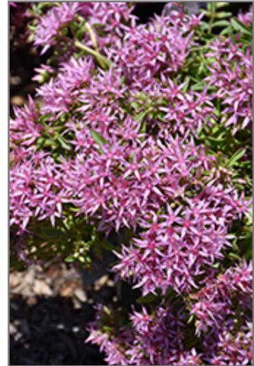
Spot On Pink Stonecrop flowers