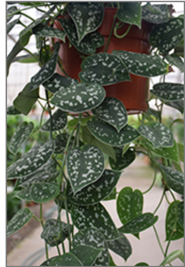
Argyraeus Pothos foliage