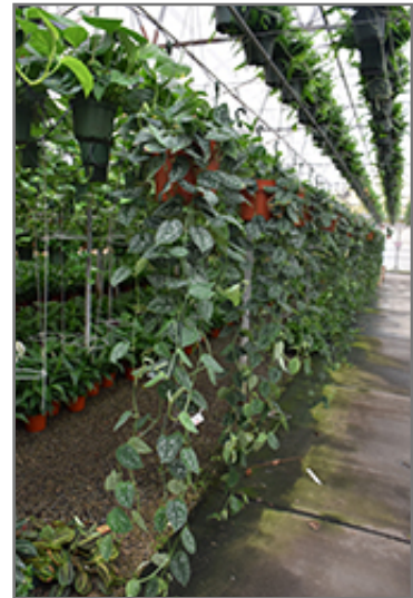
Argyraeus Pothos in full

-- THIS IS A TROPICAL PLANT AND SHOULD NOT BE EXPECTED TO SURVIVE THE WINTER OUTDOORS IN OUR CLIMATE --